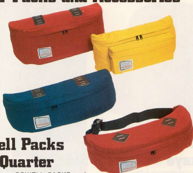
Powell Packs—Large, Regular, Small, HineQuarter.

The three POWELL PACKS and HINEQUARTER are primarily designed for ski touring, bicycling and hiking where shoulder freedom and low center of gravity are an advantage. These packs are designed to be worn around the waist, thus completely freeing the wearer's shoulders and moving the weight down for better balance. Features include two sliders on the zipper for quick and easy access, two accessory strap holders on top (except on the HINEQUARTER) for strapping on extra items and a wide 2" waist belt for added carrying comfort. Each model is contoured for a better fit against the user's back and is light enough to be carried as a second pack inside a frame pack. In addition to the above features, the HINEQUARTER has an extra pocket for the individual who wants to separate his equipment.